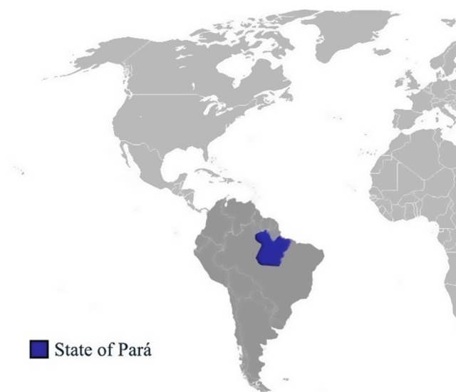
Figure 1 State of Pará (North Region, Brazil).

A total of 30,224 subjects of both sexes and different age groups who had 25(OH)D serum levels measured at a local laboratory service from January to December of